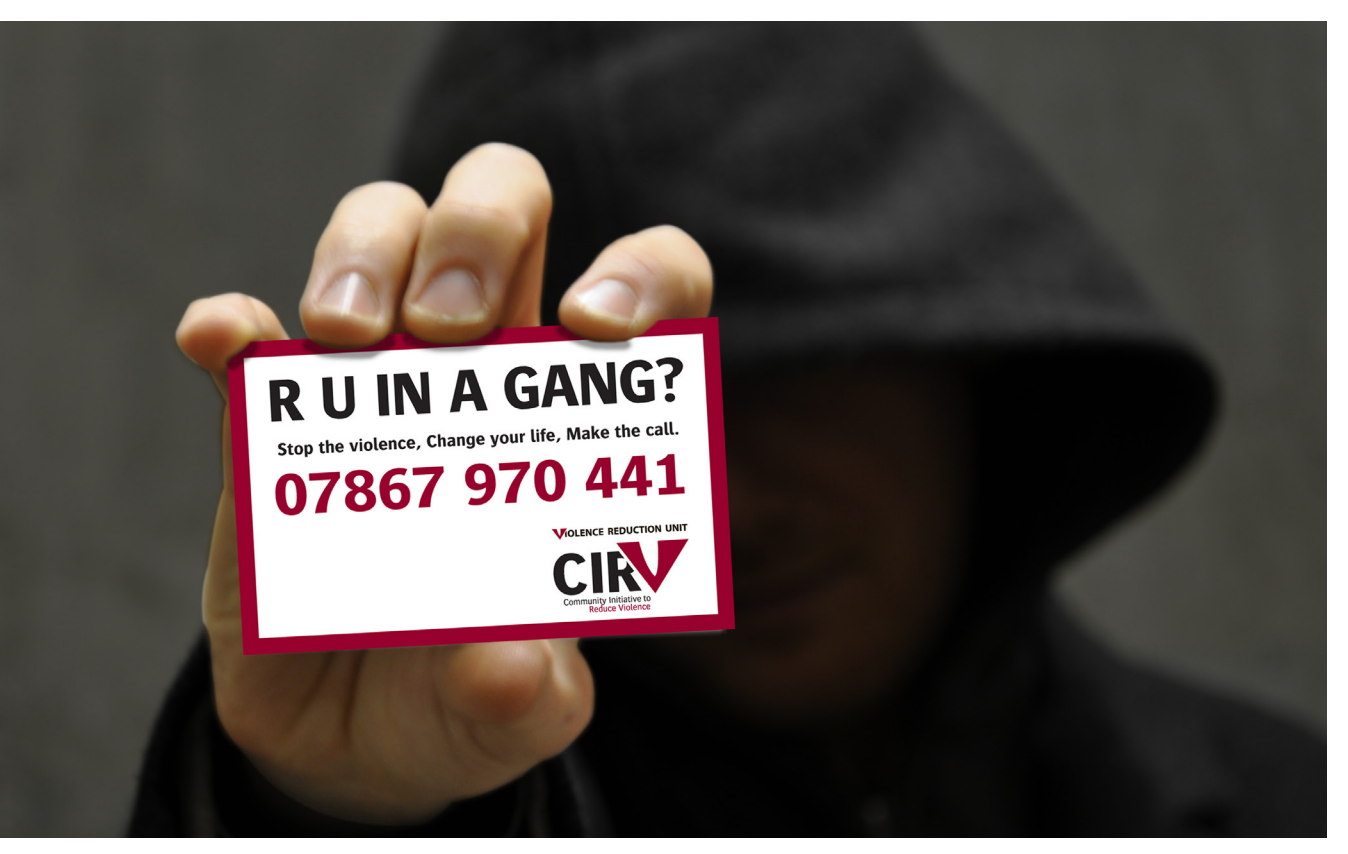
Third Quarter Progress Report May 2010